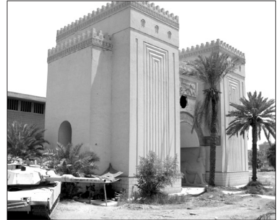
Iraq National Museum

Since the invasion of 2003, the devastation in Iraq has been staggering. Oriental Institute scholars are deeply concerned about the human suffering of the Iraqi people and the well-being of their friends and colleagues in Iraq. As archaeologists and citizens, they are also alarmed by the continuing destruction of Iraq's cultural heritage. The 2003 looting of the Iraq National Museum in Baghdad was widely reported, but the ongoing and large-scale looting of archaeological sites throughout Iraq is an even greater threat to Iraq's cultural heritage. In the ancient past Iraq was the birthplace of cities, writing, and the wheel. Iraq continued to be a center of world civilization as the homeland of the Sumerian, Assyrian, and Babylonian empires, and the capital of the early Islamic Abbasid empire. This irreplaceable loss of Iraq's cultural heritage is a loss to us all. The speaker will discuss the current state of affairs.